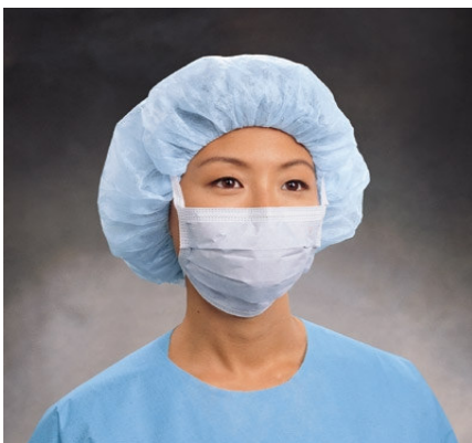
Photo of a Surgical Mask – These masks are not considered to be PPRE by Ontario Health and Safety Practitioners.

Surgical masks worn by infected persons may play a role in the prevention of influenza by reducing the amount of infectious material that is released into the environment. If worn to prevent exposure, surgical masks offer a physical barrier to contact with contaminated hands and ballistic trajectory particles. Their biggest limitation is that they do not provide an effective seal to the face, thereby allowing inhalable particles access to the respiratory tract. In addition, the efficiency of the filters of surgical masks in blocking penetration of tracheobronchial or alveolar-sized particles is highly variable and their efficiency in blocking nasopharyngeal-sized particles is unknown.