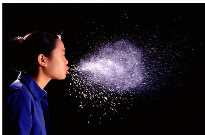
Particle mist created upon sneezing (Davidhazy, 2007).

There are two primary routes by which influenza virus exits the respiratory tract of an infected person: (i) expulsion of the virus into the air through sneezing, coughing, speaking, breathing or through aerosol-generating medical procedures, or (ii) by direct transfer of respiratory secretions to another person or surface. The new host acquires the virus either by inhalation of the infectious particles from the air or by contact with infectious material directly or via self-inoculation through a contaminated hand.