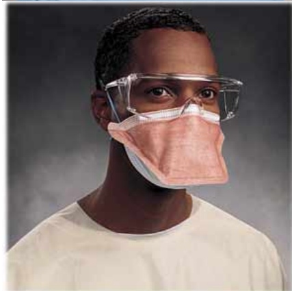
Photo of a Particulate Filtering Face Piece – The performance of these respirators depends on the filter efficiency and the fit.